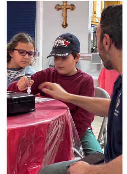
The Acharya Family Strategizing!