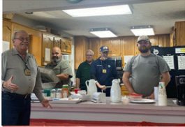
The Knights of Columbus hosted the Sunday breakfast.