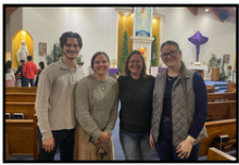
Just A few that were going Home with Ashes!