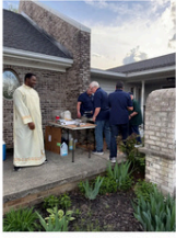
UPPER LEFT: The Knights of Columbus, gearing up for a successful fundraiser. Good job, gentlemen!