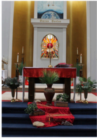
PALM SUNDAY ALTAR, FATHER BLESSING THE PALMS, RAISING PALMS IN PRAISE AND THANKSGIVING!