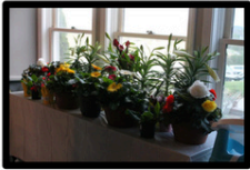
FLOWERS FOR THE ALTAR FROM DONATIONS!